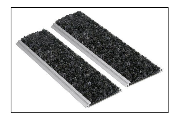
OBEX™ Bar / Cut