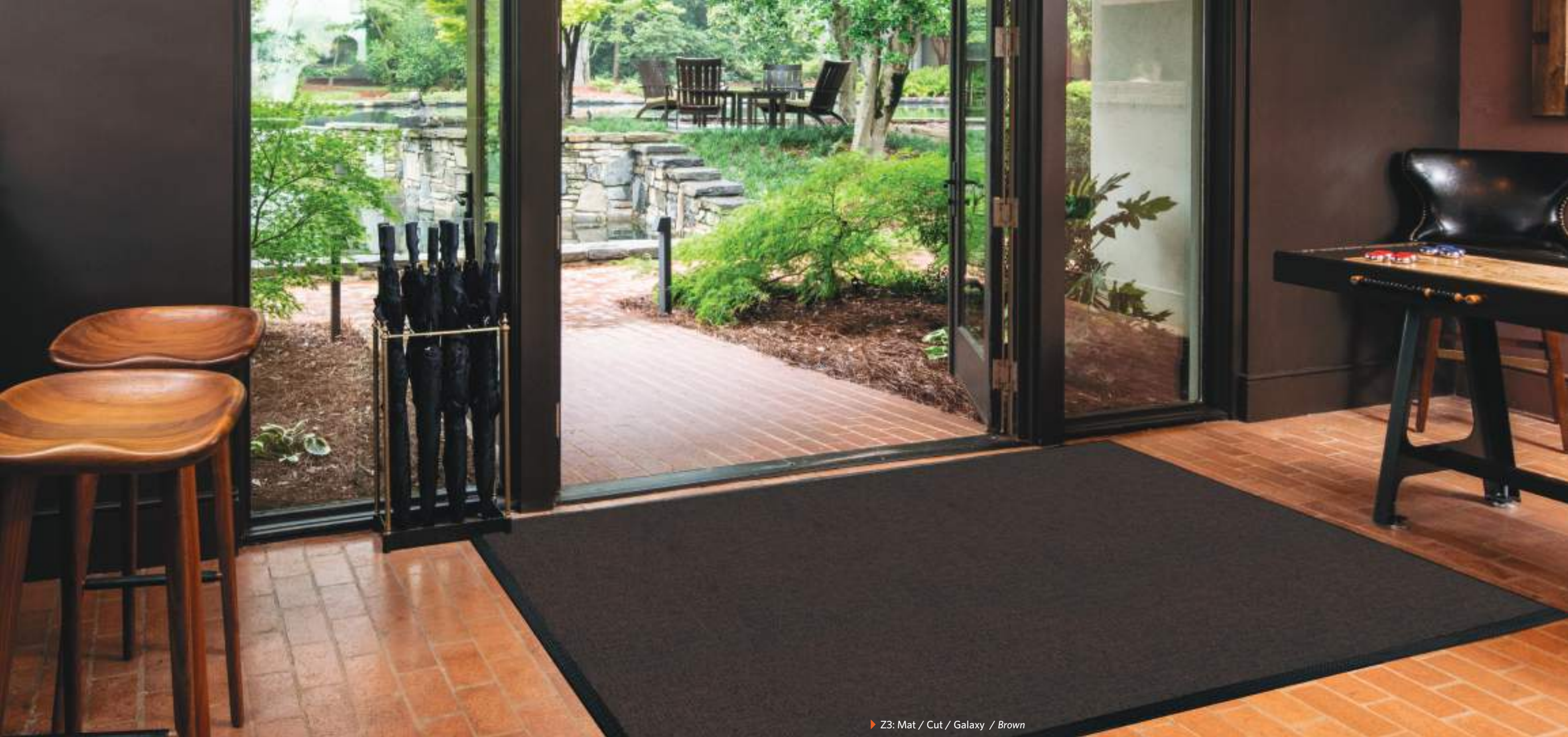
▶ Z3: Mat / Cut / Galaxy / Brown