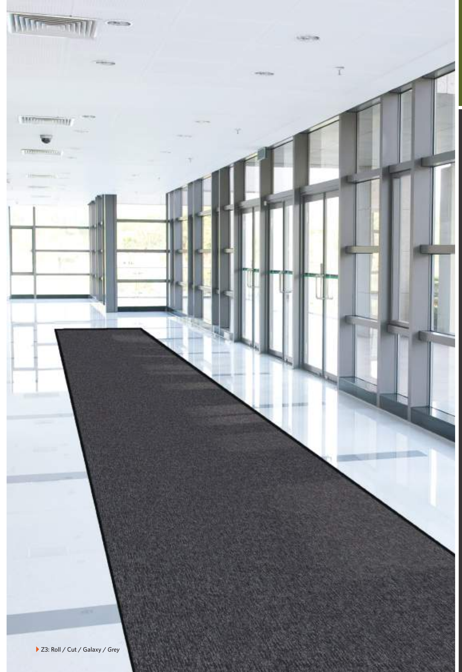
▶ Z3: Roll / Cut / Galaxy / Grey